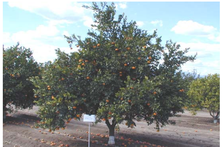
Figure 2: Yosemite Gold ® tree on Carrizo at Riverside

Tree Characteristics: Tree shape (Figure 2) is approximately spheroid, rather similar to that of orange trees. Leaves are on the large size for a mandarin with leaf shape more orange than mandarin-like. Canopy density is good with many fruit born inside the canopy, which serves to limit sunburn and help maintain the very distinct rind color. Fruit exposed to excessive sun will lose significant color on the exposed surface. Overall trees are vigorous, more so than most mandarins. In comparison with most old-line citrus cultivars, trees of 'Yosemite Gold' are slightly thorny, with normal branches having short length (4 mm, 1/8-1/4 in.) thorns at about 13% of the nodes, with vigorous sprouts having short (4 mm) thorns at about 3% of nodes. Thorniness will probably decrease as the cultivar ages. To reduce thorniness, budwood should be selected from thornless, upper canopy branches.