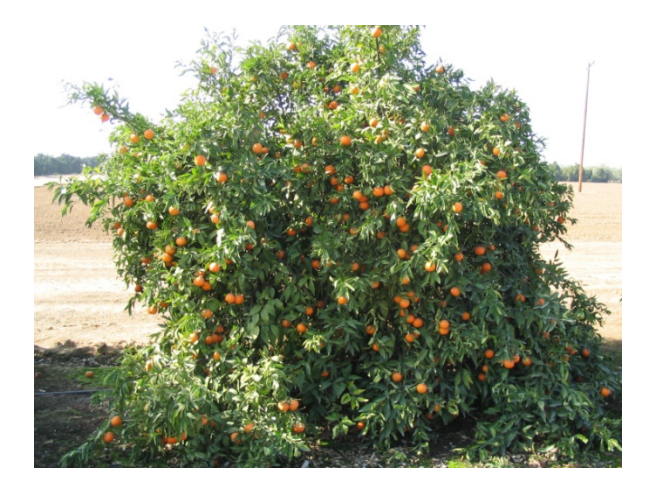
Fruit of 'FairchildLS' and 11-year-old mother tree on Carrizo citrange rootstock