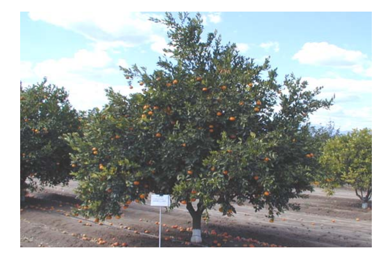
Figure 1: Fruit of Yosemite Gold® from Riverside