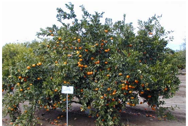
Figure 2: Shasta Gold ® tree on Carrizo at Riverside

Tree Characteristics: Tree shape (Figure 2) is approximately spheroid, rather similar to that of orange trees. Leaves are on the large size for a mandarin with leaf shape more orange than mandarin-like. Canopy density is very good and many fruit are born inside the canopy, which serves to limit sunburn and help maintain the very distinct rind color. Fruit exposed to excessive sun will lose significant color on the exposed surface. Overall trees are vigorous, more so than most mandarins. In comparison with most old-line citrus cultivars, trees of Shasta Gold ® are fairly thorny, with normal branches having medium length (15 mm) thorns at about 50% of the nodes, and watersprouts having long (31 mm) thorns at about 73% of nodes. Thorniness will probably decrease as the cultivar ages. To reduce thorniness, budwood should be selected from thornless, upper canopy branches.